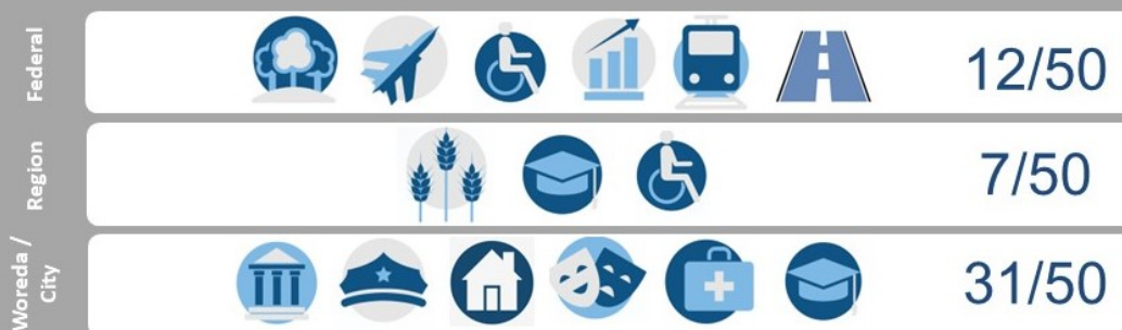
Figure 2. De facto assignment of public sector functions and responsibilities in Ethiopia

The constitution does not provide specific functions to the federal government in the areas of providing basic services, such as agriculture extension services, health care and education save for the power to set national standards and adopt policies. It does not, for instance, state primary school is a state function and higher education belongs to the federal government. It is silent on these specific issues. As these functions are not in the list of federal competencies, one might argue the responsibility to provide health care (from health post to hospitals) and education (from pre-primary education to tertiary education) belongs to the states. Yet, in practice, this is not indeed the case. In practice, in the area of healthcare, the federal government is responsible for building and running hospitals while in the area of education, it is in charge of establishing and running universities (Garcia & Rajkumar 2008). Yet some states, such as Oromia, and Addis Ababa have their own universities.